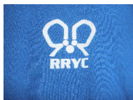
(Front - left breast)